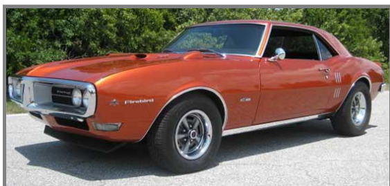
1968 Pontiac Firebird